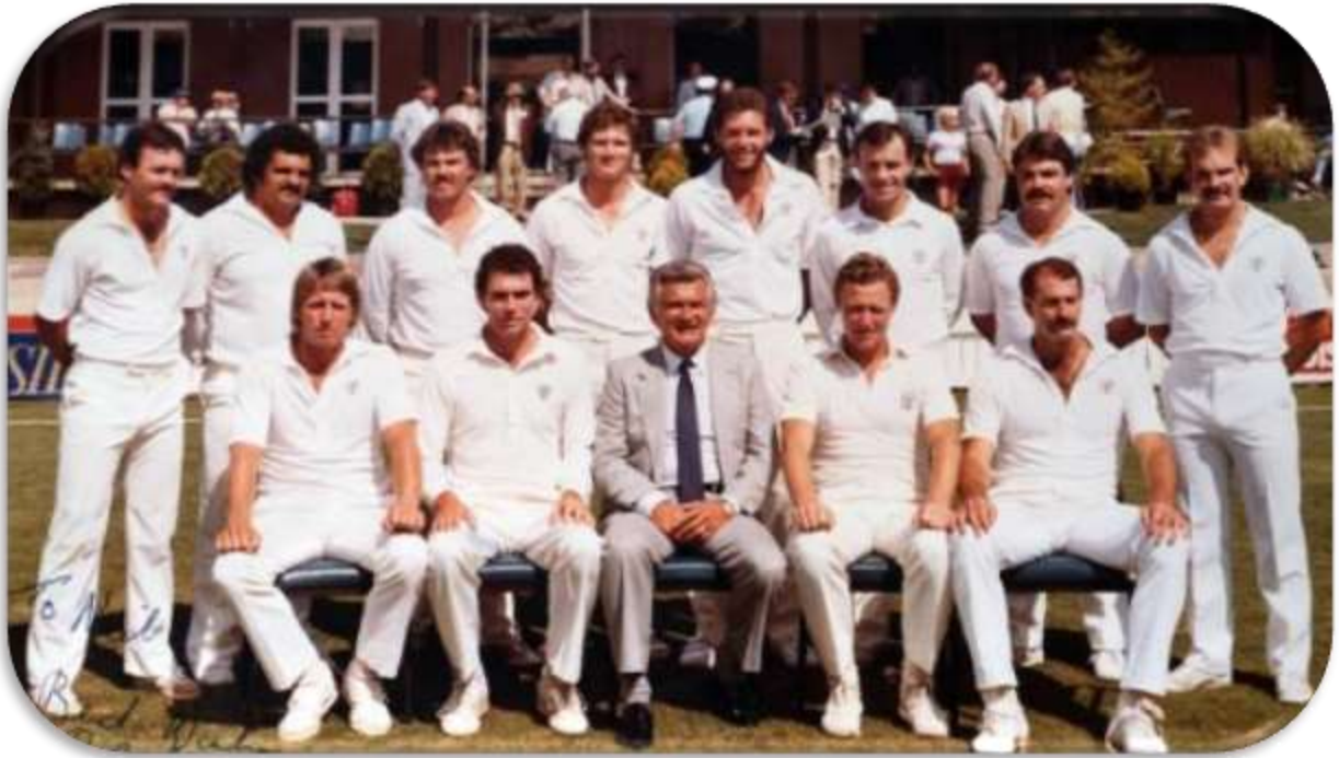
1984 PMs XI