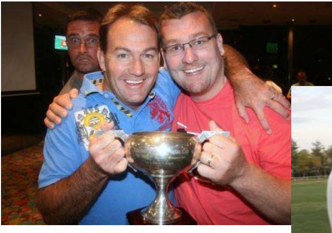
Frostie and Ditts with the Premiership Cup with Southie looking on