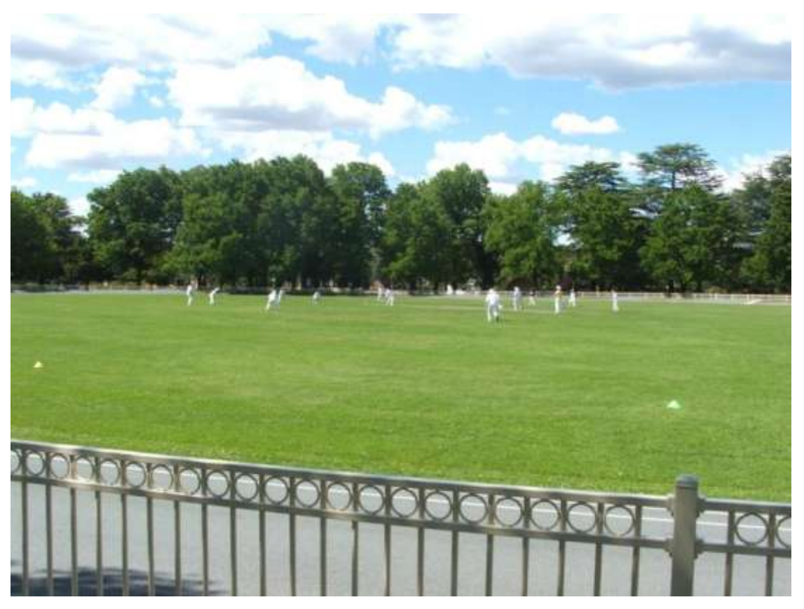
Queanbeyan Town Park on a sunny afternoon

5<sup>th</sup> Grade had a reasonably successful season by finishing on top of the ladder after the home and away matches. Disappointing not to, or at least, make it to the Grand Final but that's the way cricket goes sometimes. I firmly believe we had the side to take it out but just couldn't quite put it together during the semi final.