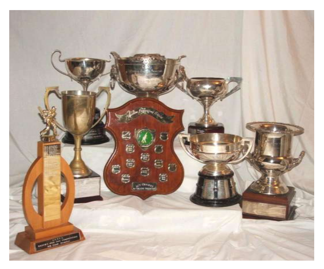
The Trophy Cabinet