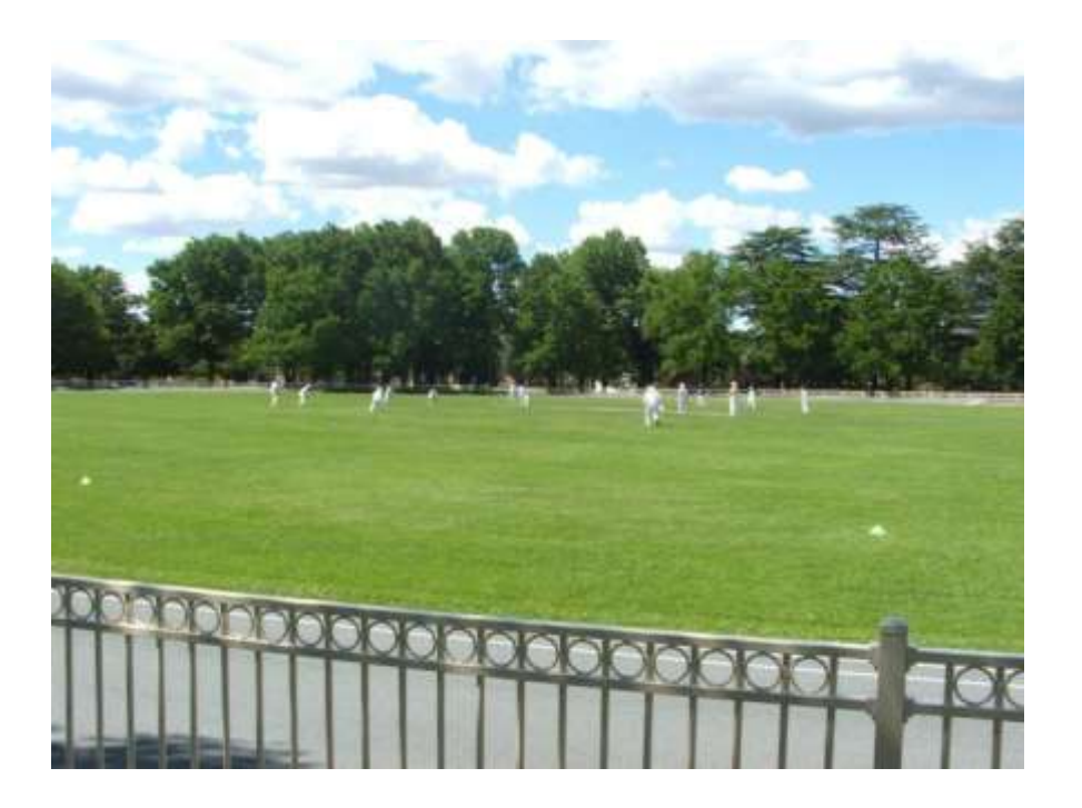
Picturesque Town Park on a Saturday afternoon